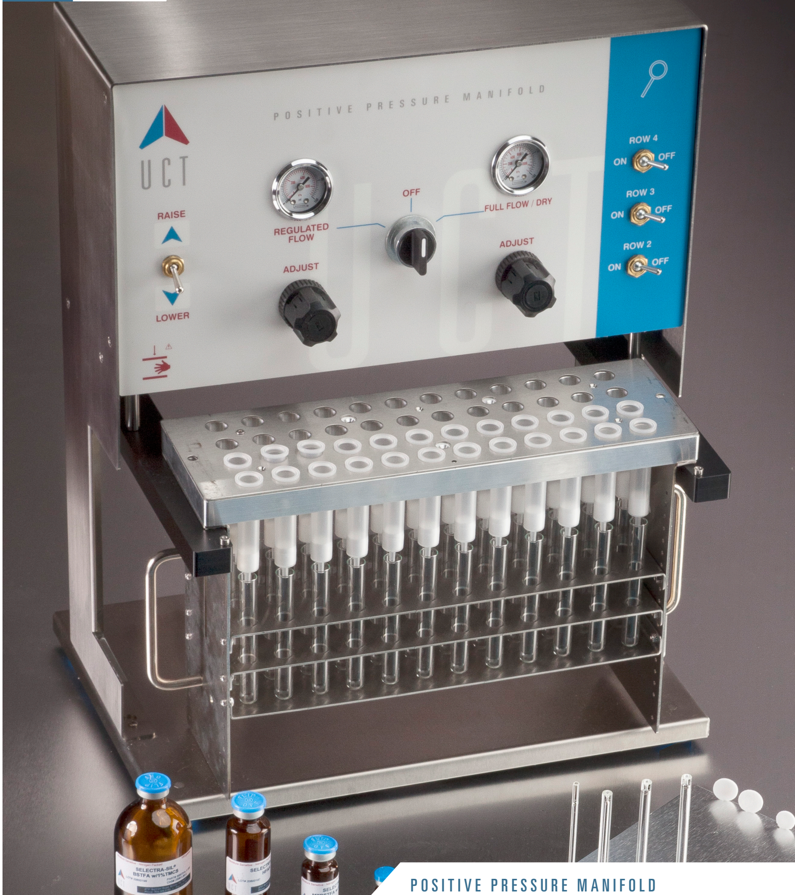
POSITIVE PRESSURE MANIFOLD