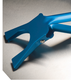
90mm Aluminum Clamp